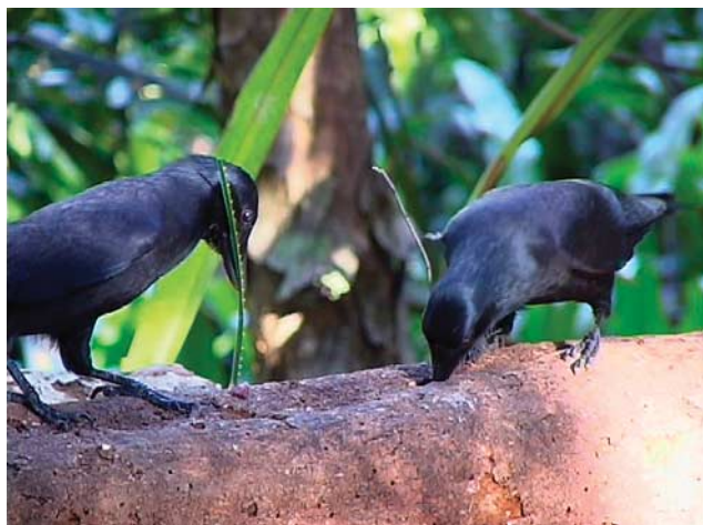
Figure 1. A New Caledonian crow pair which exclusively selected either pandanus tools (female at left) or stick tools (male at right).